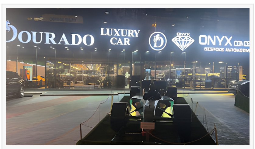
Dourado Luxury Car Showroom

The luxury car market in the UAE has long been a symbol of affluence and innovation, with Dubai serving as a