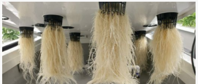
Brilliant AEssenseGrows Aeroponic Roots at Endo Canna