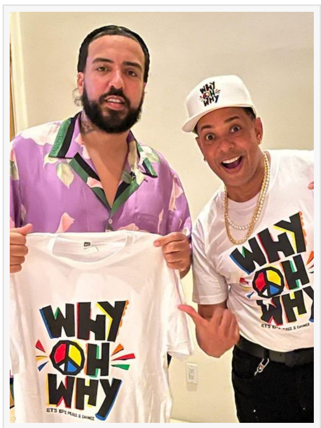
Raffles Van Exel and Rapper French Montana

This press release can be viewed online at: https://www.einpresswire.com/article/800973521