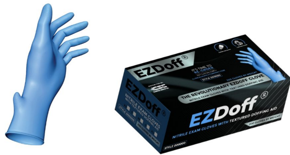
The new EZDoff exam glove by CSC

Emergency departments testing EZDoff® gloves reported a 78.4% reduction in contamination risks compared to standard gloves. This improvement provides a significant boost to safety protocols in fast-paced environments where traditional gloves often fall short during removal, leaving workers vulnerable to exposure.