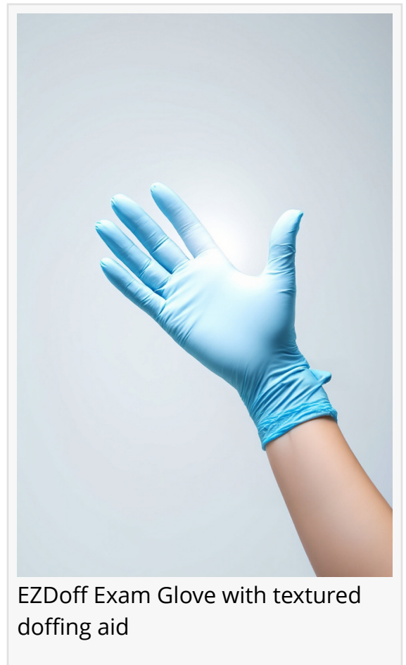
EZDoff Exam Glove with textured doffing aid