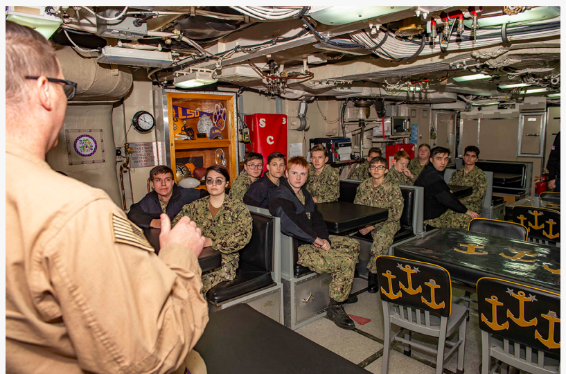
Sea Cadets receive a briefing aboard a U.S. Navy submarine.

This year's advanced career and leadership training in Groton will take place from July 20 to July 26. Cadets will learn how submarines work and tour submarines, while completing the basic, unclassified submarine school curriculum with hands-on instruction from submarine trainers.