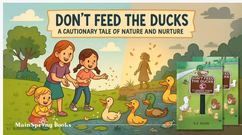
Don't Feed the Ducks: It Makes Them Dependent