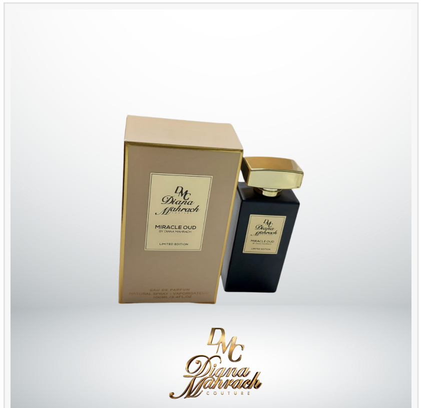
Miracle Oud by Diana Mahrach