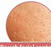
Rough facial contours