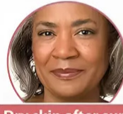
Dry skin after sun