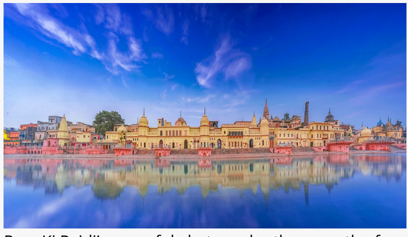
Ram Ki Paidi's peaceful ghats under the warmth of the sun.

the seventh incarnation of Lord Vishnu. It falls on Chaitra Shukla Navami, the ninth day of the Hindu lunar calendar's Chaitra month. Revered as Maryada Purushottam (Supreme Being of Righteousness), Lord Ram symbolizes righteousness, compassion and dharma. The celebration is not only a religious occasion but also a reaffirmation of values deeply embedded in Indian civilization.