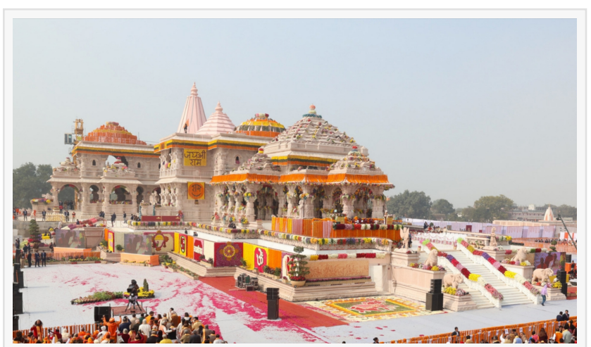
Ram Mandir - A divine symbol of devotion and heritage standing tall in Ayodhya.

Ram Navami is a major Hindu festival that celebrates the birth of Lord Ram,