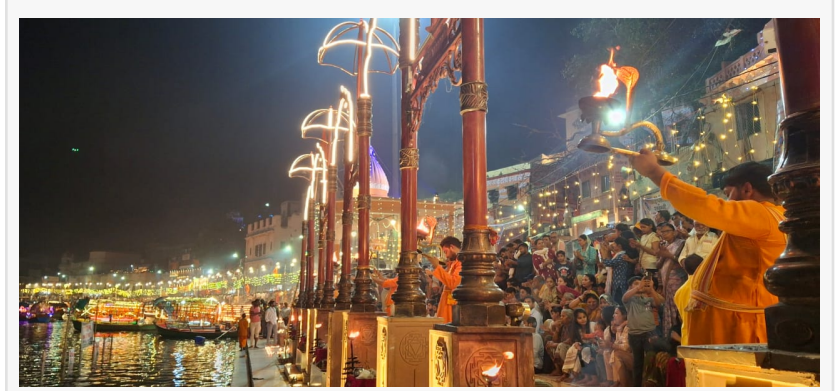
Aarti being performed in a divine atmosphere of chants and light