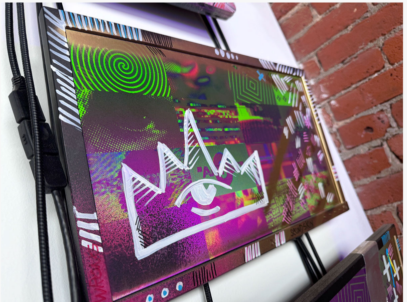
Closeup of one of the TV Monitors activated!