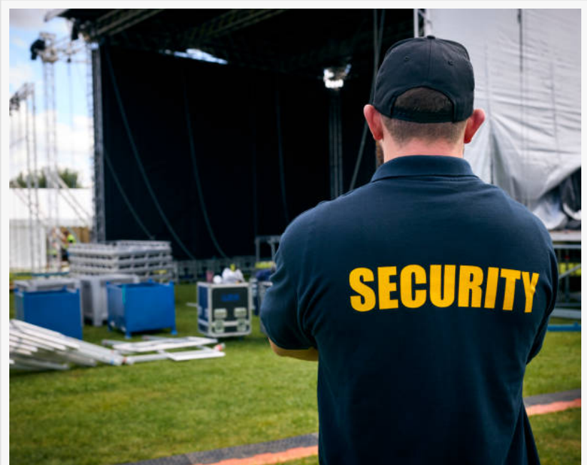
Entertainment industry security personnel

As one of the best security guard companies in California, Allied Nationwide Security has been dedicated to protecting communities since 2003. With over two decades of proven excellence, the company has earned a reputation for trust, reliability, and professionalism. Their expert team specializes in delivering customized patrol and protection services, ensuring each client receives the exact level of security they need. From church security to equipment yard security and entertainment industry security, Allied provides experienced guards who are thoroughly trained and prepared to handle a wide range of