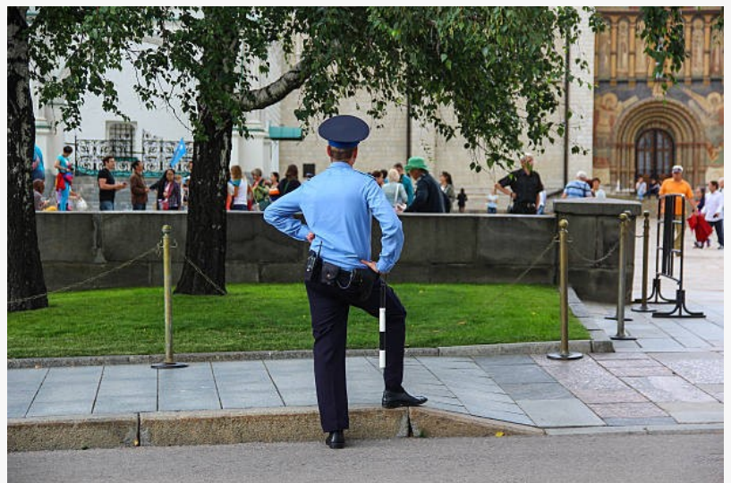
Church security patrols

Allied Nationwide Security recognizes the unique environment of churches and the need for a gentle yet vigilant approach. Their guards are not just trained in standard security protocol—they're taught how to respect religious customs and interact with sensitivity. This allows them to maintain a warm, welcoming atmosphere while providing a strong security presence. Every guard goes through a thorough vetting process, including background checks, fingerprinting, and ongoing professional training. These officers know how to detect suspicious behavior early and respond quickly without causing unnecessary alarm. They're stationed at entry points, patrol the grounds, and