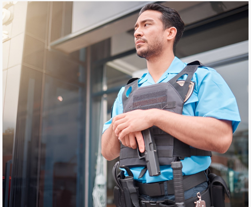
armed security guard services.