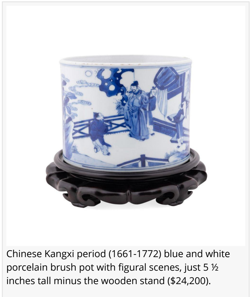
Chinese Kangxi period (1661-1772) blue and white porcelain brush pot with figural scenes, just 5 ½ inches tall minus the wooden stand ($24,200).