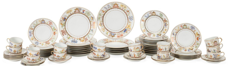
69-piece partial dinner service for 15 by Tiffany & Co. in the Cirque Chinois pattern (first introduced in 2001), private stock Atelier Le Tallec (French, 1930-2014) ($19,360).