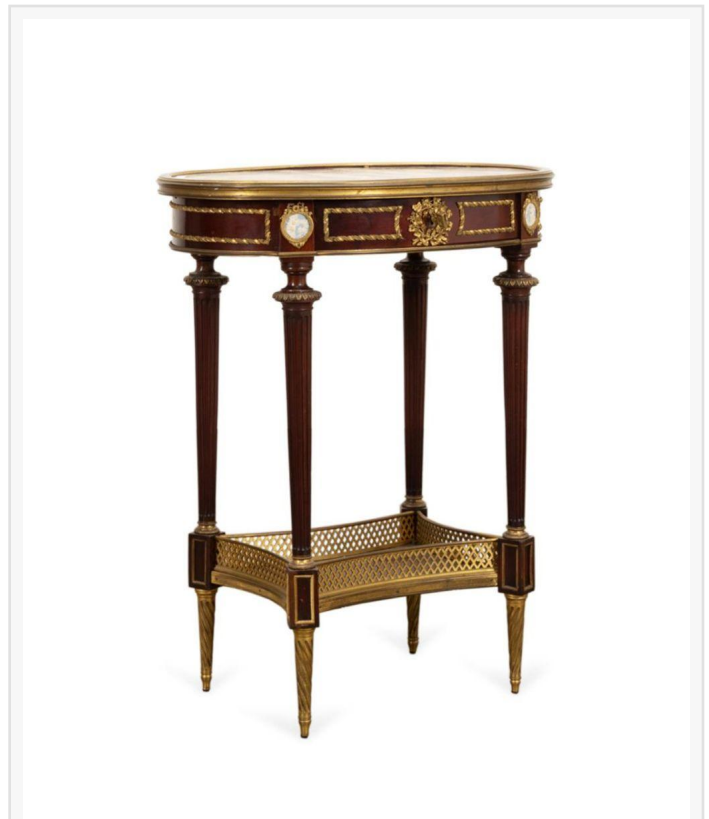
Louis XVI style marble-top gueridon table in the manner of Henry Dasson (French, 1825-1869), with ormolu mounts, round jasperware plaques, and turned fluted legs ($4,840).