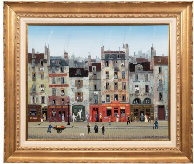
Oil on canvas paintings by Michel Delacroix (French, b. 1933), rendered around 1984 and titled Musiciens de Rue (Street Musicians), signed and inscribed "Paris" lower left ($16,940).

Following are additional highlights from the auction, which attracted about 20 in-person bidders to the gallery and grossed $750,411, including the buyer's premium. Internet bidding was provided by LiveAuctioneers.com, Invaluable.com and bid.AandOauctions.com. There were more than 66 people who submitted bids via phone. Approximately 400 people either tuned in or checked in to the sale.