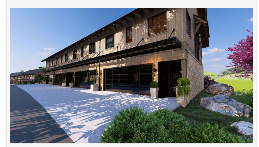
Luxury Garage Lofts

This press release can be viewed online at: https://www.einpresswire.com/article/801378238