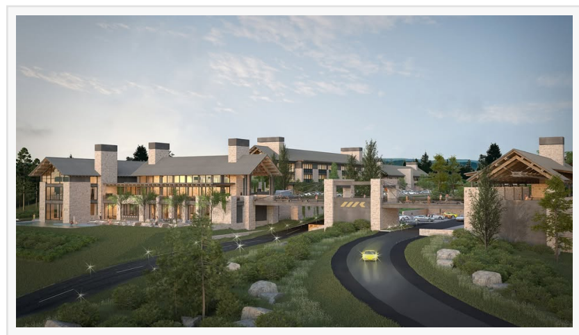
Flatrock Motorclub Entrance

Tresa Halbrooks LEGACY PR tresa@legacy-pr.com