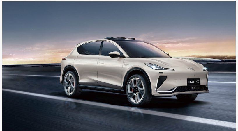
The IM LS7, set to be the first IM Motors model launched in the GCC with SMI, is a fully electric SUV featuring AI technology and a zero-gravity rear seat.