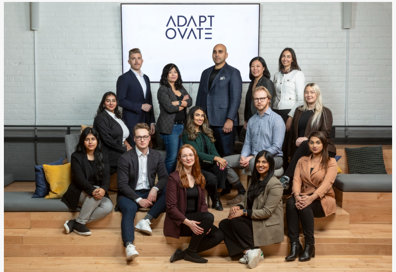
Adaptovate Inc Team 2025

TORONTO, CANADA, April 9, 2025 /EINPresswire.com/ -- Adaptovate Inc is proud to announce its recognition as one of Canada's Top Small & Medium Employers (2025) by Mediacorp Canada Inc., organizers of the annual Canada's Top 100 Employers project. The award acknowledges the company's commitment to building a dynamic, flexible, and people-focused work environment that fosters both professional and personal growth.