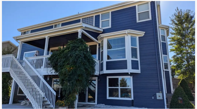
Exterior Painting in Denver

This press release can be viewed online at: https://www.einpresswire.com/article/801590952