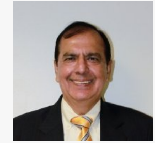
Practice Director, Surrogacy4all and Indian Egg Donors

"We both induced lactation and took turns feeding our son. It gave us a shared parenting experience from the very first moment."