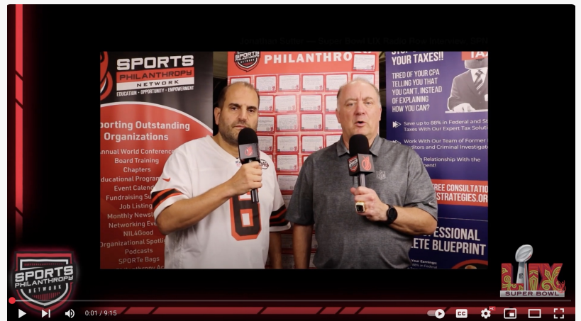
TravelingWiki's CEO Reports from Super Bowl LIX Radio Row with Sports Philanthropy Network