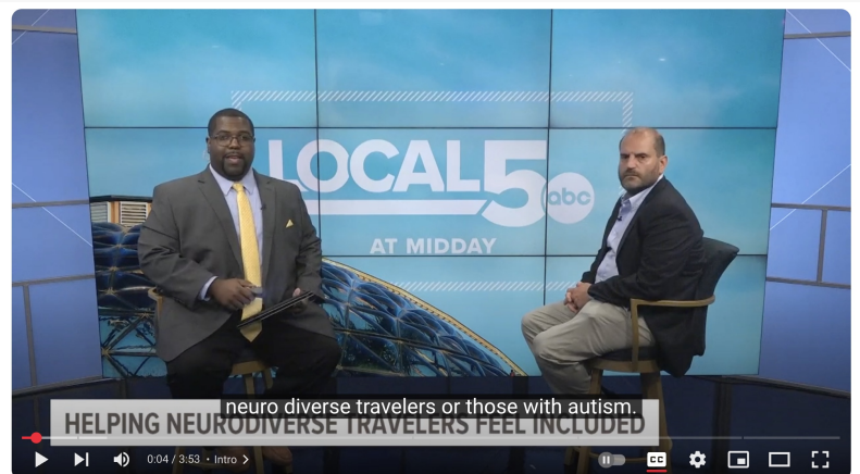
Traveling Wiki aims to help neurodiverse travelers feel included