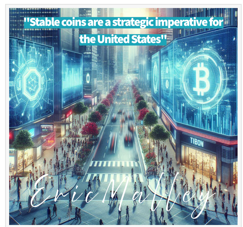
Stablecoins as Catalysts for Economic Transformation and Modern Finance

EricMalley.com, a leading voice in future-forward economic analysis, today released a groundbreaking analysis on the transformative potential of stablecoins, positioning them as a critical catalyst for modernizing finance and building a more equitable economic future.