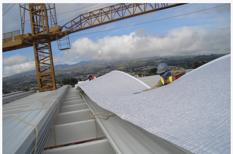
Prodex Total Insulation being installed on large metal building, hard hats

Insulation4Less.com is dedicated to providing high-quality insulation products tailored to meet the diverse needs of builders, contractors, and homeowners. With a commitment to innovation and customer satisfaction, Insulation4Less.com offers a wide range of insulation solutions designed to enhance energy efficiency and comfort in various building applications.