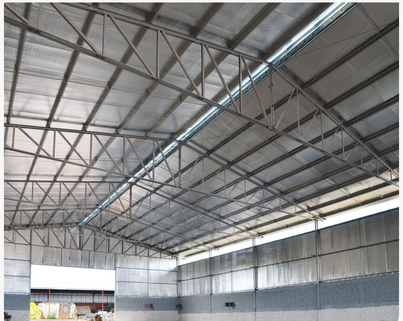
Prodex Total Insulation in large metal warehouse