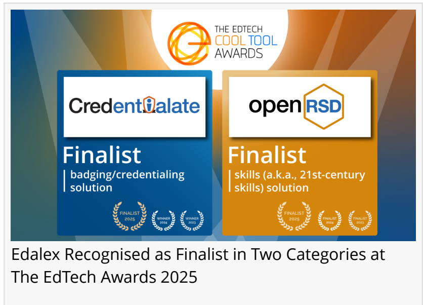
Edalex Recognised as Finalist in Two Categories at The EdTech Awards 2025

MELBOURNE, AUSTRALIA, April 10, 2025 /EINPresswire.com/ -- Edalex , the company powering organisations' single source of truth for skills, credentials and learning data, has been named a finalist in two categories at the prestigious The EdTech Cool Tool Awards 2025, marking the third consecutive year of recognition for the company's innovative platforms. Credentialate and openRSD were finalists in the Badging/Credentialing Solution and Skills (a.k.a., 21st-century skills) Solution respectively.