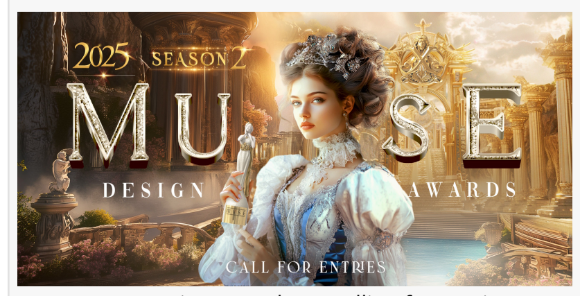
2025 MUSE Design Awards S2 Calling for Entries

announce the winners of the distinguished 'Design of the Year' title. Selected from an extraordinary pool of entries, these winning works represent the pinnacle of design and technical mastery in their categories. Here are this season's outstanding winners: