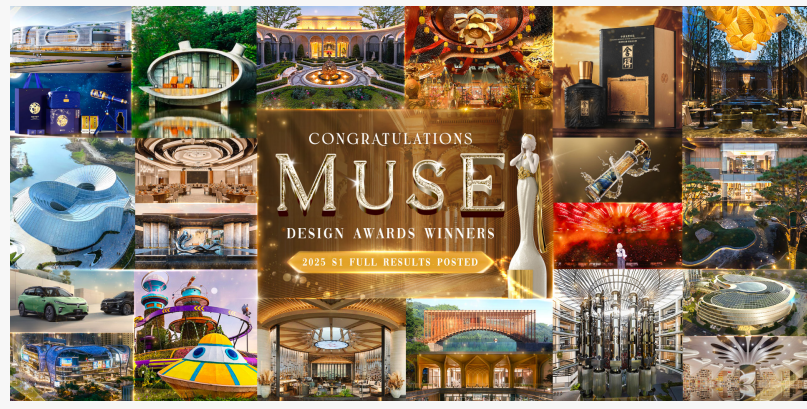
2025 MUSE Design Awards S1 Full Results Announced

MUSE Design Awards Reveal Season 1 <u>Design of the Year</u> Winners As Season 1 comes to a close, the MUSE Design Awards proudly