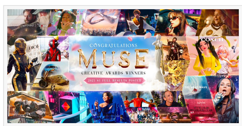
2025 MUSE Creative Awards S1 Full Results Announced

NEW YORK, NY, UNITED STATES, April 17, 2025 /EINPresswire.com/ -- The 2025 MUSE Creative Awards and MUSE Design Awards have announced this season's exceptional winners, continuing a decade-long tradition of celebrating milestones in creative and