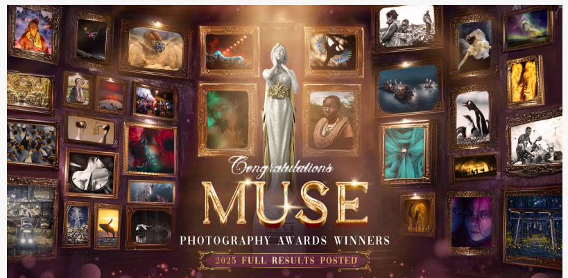
2025 MUSE Photography Awards Full Results Announced

NEW YORK, NY, UNITED STATES, April 22, 2025 /EINPresswire.com/ -- The International Awards Associate (IAA) proudly unveils the winners of the 2025 MUSE Photography Awards , marking a historic moment as MUSE celebrates its 10th anniversary. This prestigious competition continues to set new global standards, attracting over 4,000 entries from more than 40 countries. As the art of photography transcends borders, this year's winners exemplify the power of visual storytelling, capturing emotions, cultures, and perspectives that resonate worldwide.