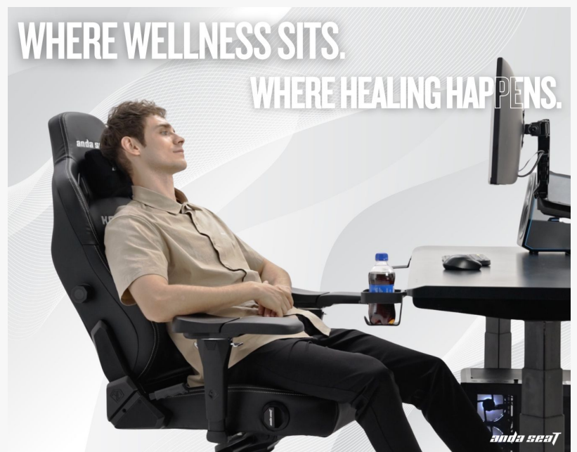
#AndaSeatEmpowersAll Kaiser 4 Greatness