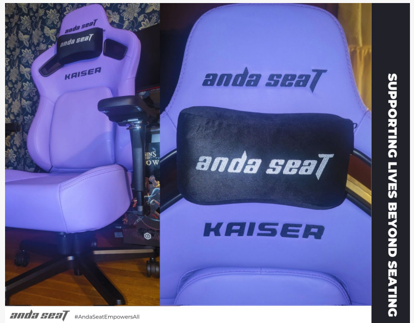
#AndaSeatEmpowersAll Kaiser 4 Zen Purple