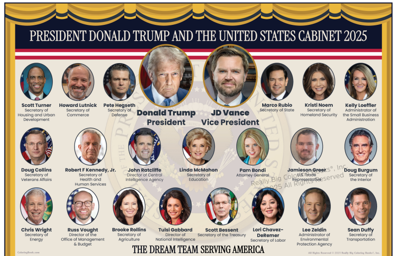
President Donald Trump and the US Cabinet Leaders 2025.

uncertainty of rules and regulations coming from countries outside the US, including import/export duties, new taxes, and the shipping and customs issues are making the book and publishing community rethink the value of their products. This also includes relationships with their customers and retail outlets. On top of that there are new initiatives transforming the