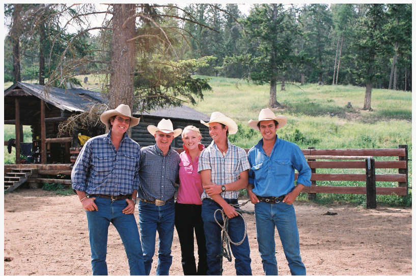
Wranglers ready to help you ride