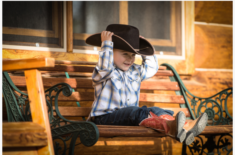
Kids love playing cowboy!