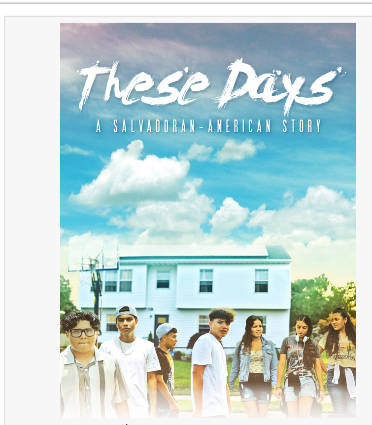
THESE DAYS - Film Poster

More than just a film, THESE DAYS is a testament to resilience and hope. Its cast and crew, including Gonzalez himself, share real-life connections to the narrative, having faced similar