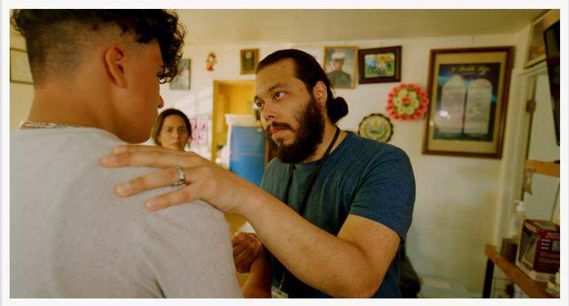
These Days-Film Still.Jay & Youth Counselor

struggles and engaged in youth programs aimed to help at-risk youth and addressing trauma.