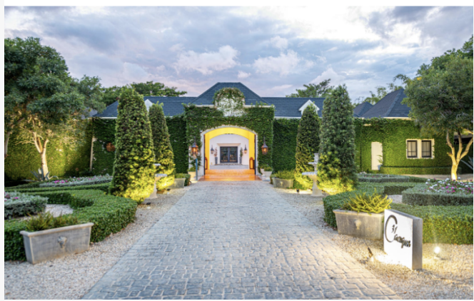
Villa Du Cacique: A 7-bed, 8.5-bath estate on Casa de Campo's "Millionaires' Row" with sea views, $500K annual rental income, and iconic history. Dominican luxury at its finest.

optimal option for buyers looking to capitalize on the growth of Las Terrenas, which continues to rise in Caribbean tourism.