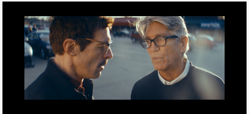
THE COMPANY WE KEEP-Film Still 1