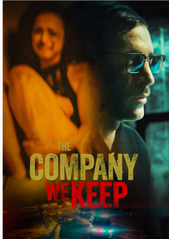
Poster.Key Art THE COMPANY WE KEEP