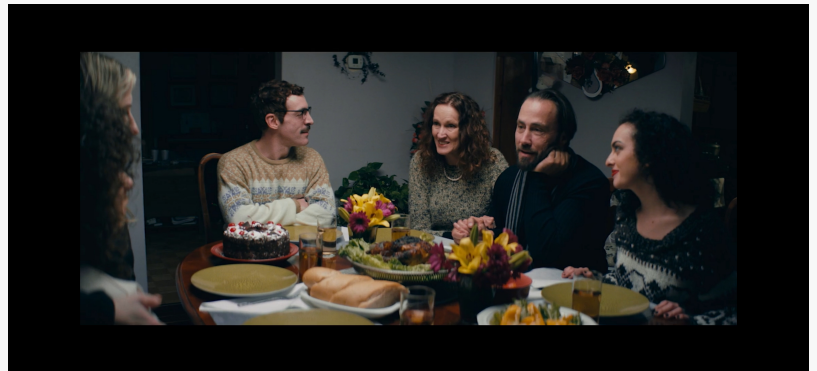
THE COMPANY WE KEEP-Film Still 3