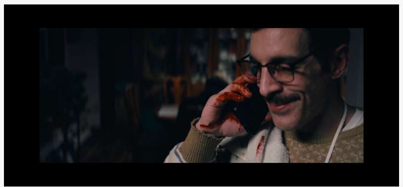
THE COMPANY WE KEEP-Film Still 2