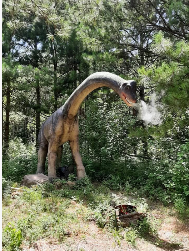
Meet the Mighty Brachiosaurus: One of Over 125 Life-Sized Dinosaurs at Sweet Valley Ranch

In addition to dinosaurs, Sweet Valley Ranch is home to more than 350 animals from five continents, including Highland cows, goats, llamas, exotic birds, East African Crown Cranes, tortoises, donkeys, and more. Animal lovers can purchase bags of feed to hand-feed many of the animals, creating up-close encounters and lasting memories for children and adults alike.