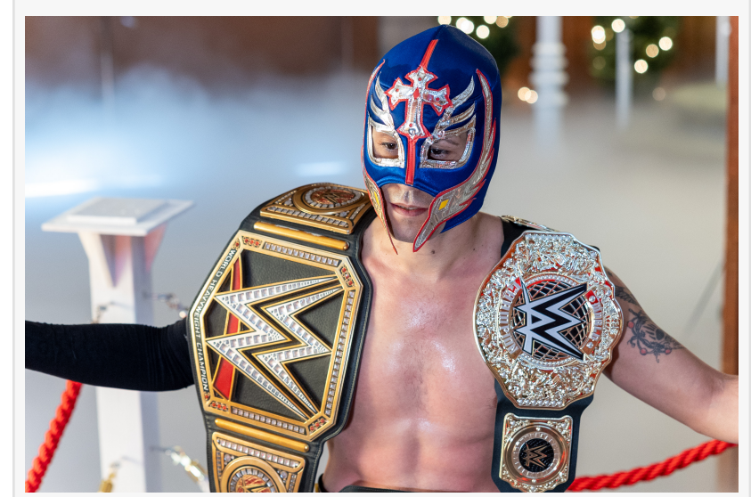
Smoke and fog fill the air as the couple makes an entrance to their Main Event wedding with a Luchador wedding officiant at Viva Las Vegas Weddings for its new Love Smackdown wedding package