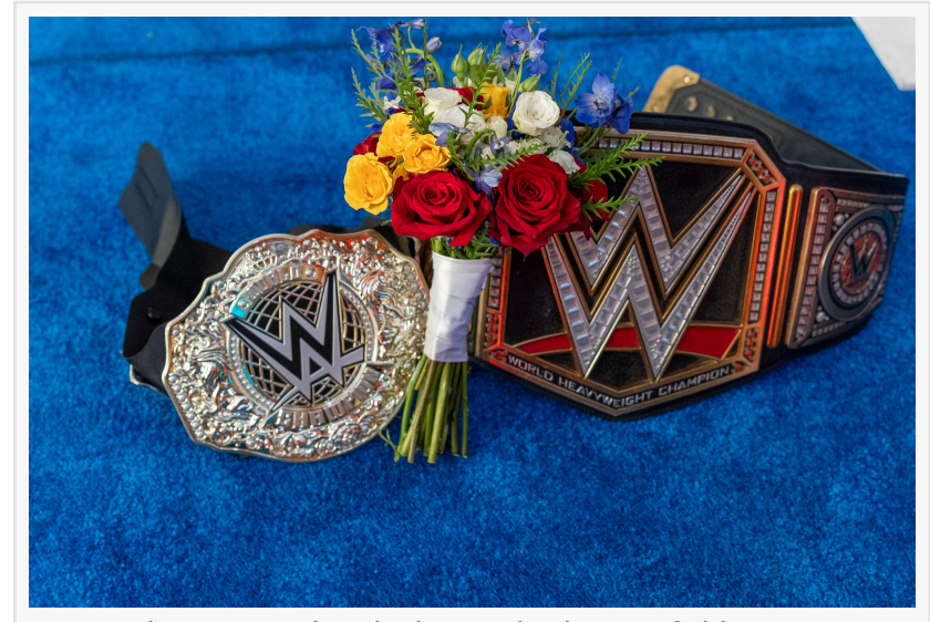
WWE Championship belts and a beautiful bouquet complement the new Love Smackdown wedding package at Viva Las Vegas Weddings

The Viva Las Vegas Wedding Chapel has been a mainstay on the Las Vegas Strip for more than 20 years. Specializing in themed weddings with theatrical productions, it's the only chapel in Las Vegas where an Elvis can literally drive the couple into the chapel in his famous pink Cadillac. Theatrical details like smoke and fog and a variety of officiant options from the Grim Reaper to Darth Vader onto a full-scale production of Rocky Horror Picture Show turn a couple's special day into a wedding for the record books. Additional themes include everything from famous movie and TV characters to iconic musicians, historical characters and much more. If you can dream it, Viva can make it happen. Beyond that, all couples married or renewing their vows at the chapel will get their name in lights following their ceremony on Viva's marquee sign right on Las Vegas Boulevard. For more information, visit FunVegasWeddings.com.