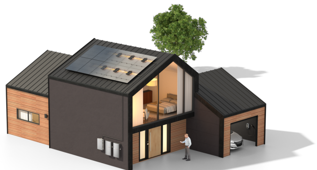
Enphase Installation Graphic

This press release can be viewed online at: https://www.einpresswire.com/article/802217813