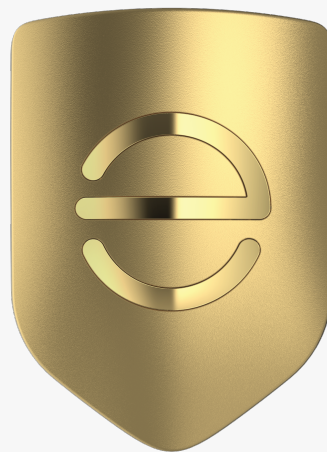
Enphase Gold Installer Badge