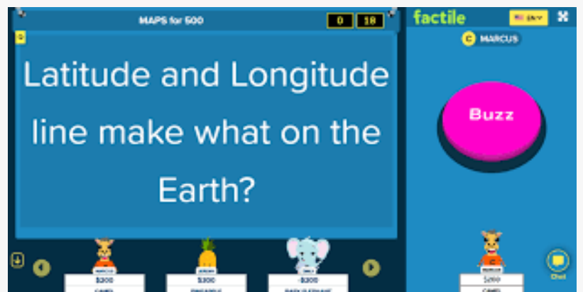
Factile game in classic Jeopardy mode with Buzzer.