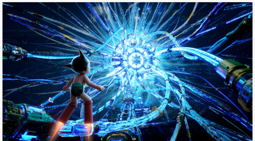
Scene from "The Birth of NEO Astro Boy" (©Tezuka Productions)