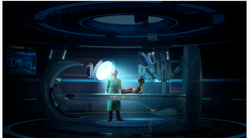
A scene from the PASONA NATUREVERSE special short movie, "The Birth of NEO Astro Boy"