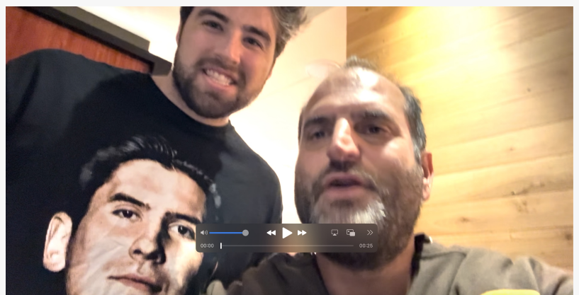
TravelingWiki Meets with Duke University Basketball at Final Four to Promote Special Needs Awareness