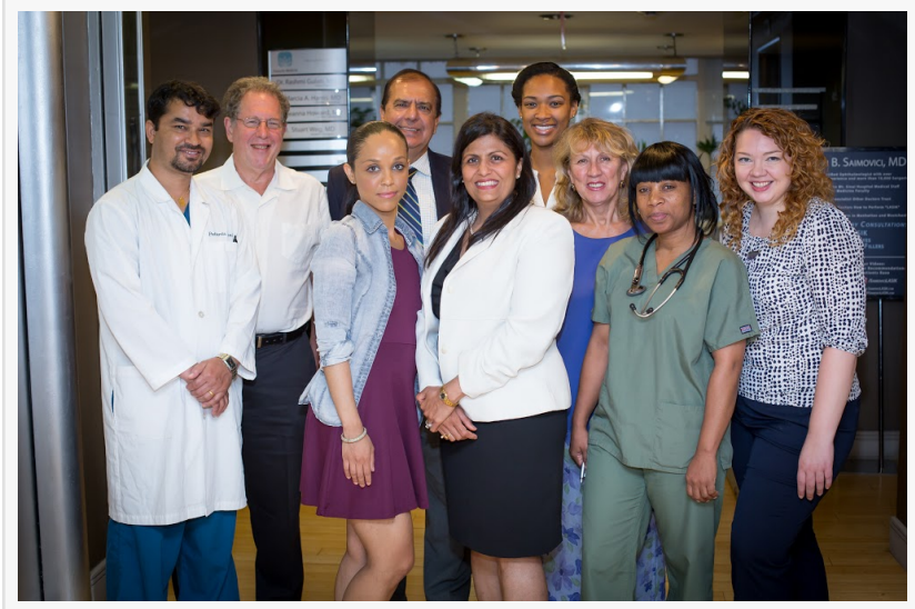
Patients Medical Staff

Patients Medical is a New York-based medical clinic that has provided holistic, integrative, and functional medicine services since 1974. Its board-certified physicians blend conventional Western medicine with advanced diagnostic tools and holistic therapies. Patients Medical specializes in chronic conditions, women's health, autoimmune disorders, hormone imbalance, and wellness optimization.