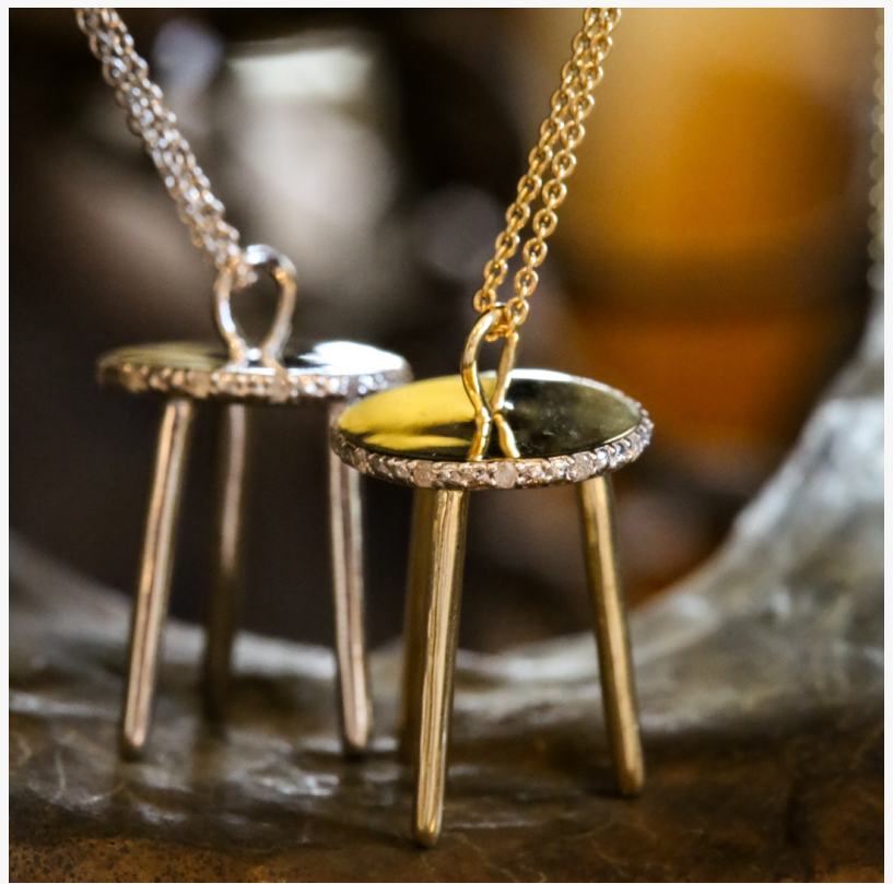
The "Stay Balanced" Necklace is available in Sterling Silver and Gold Plated

This press release can be viewed online at: https://www.einpresswire.com/article/802446926