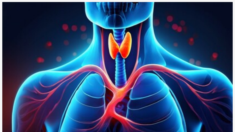
Hoshimoto's Illustration4 PatientsMedical.com