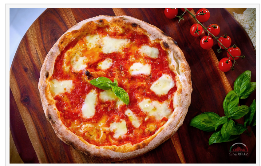
Classic Margherita pizza prepared using a Ciao Bella Pizza Oven.

With its attention to design, durability and functionality, the V2 Quattro With Stand Multi-Fuel Dual (Gas and Wood) pizza oven is set to become a cornerstone of modern outdoor cooking.