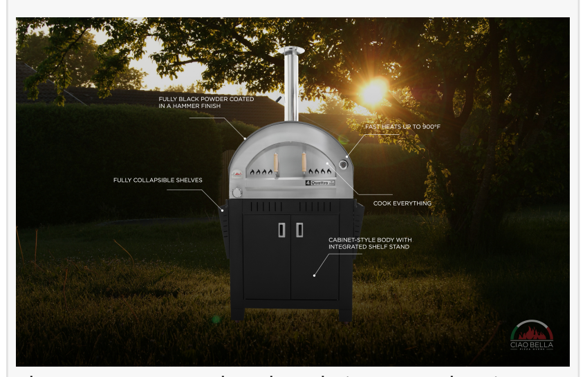
The V2 Quattro Dual Backyard Pizza Oven by Ciao Bella Pizza Ovens features a fully black powder-coated exterior in a durable hammer finish

The newly released V2 Quattro Dual Backyard Pizza Oven by Ciao Bella Pizza Ovens.