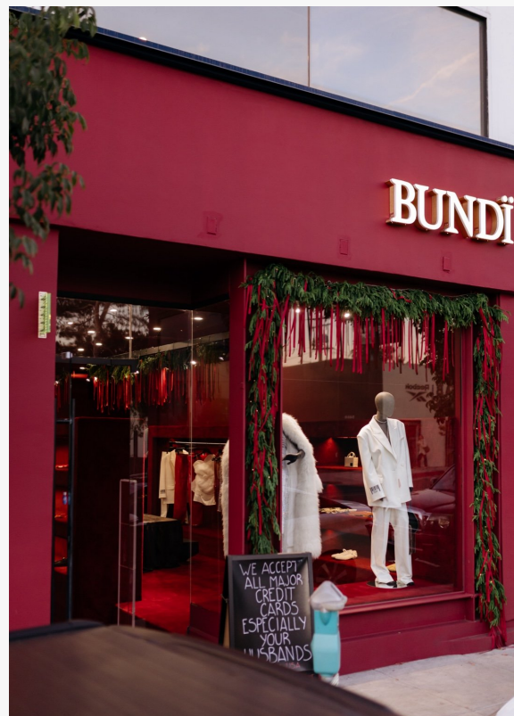
BUNDİ Store Front