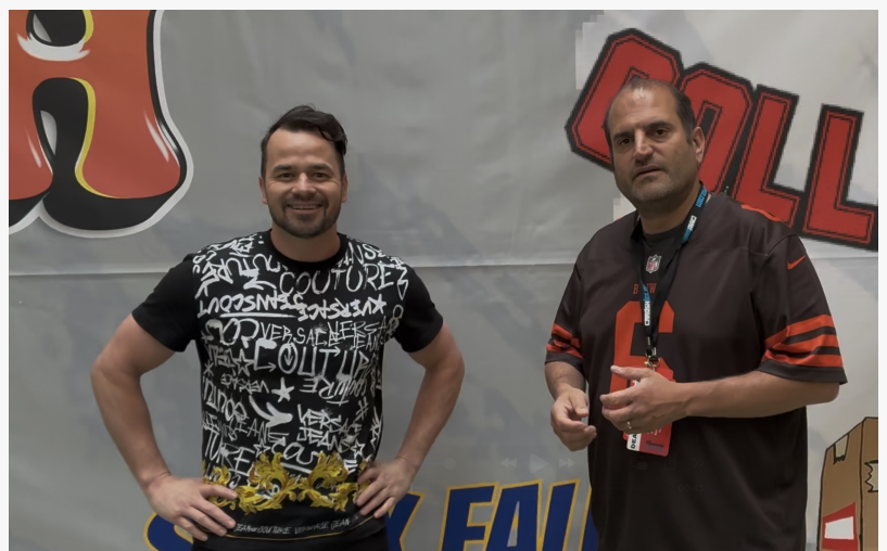
Daniel Logan of the Star Wars Film Series Films Video Spot Supporting TravelingWiki