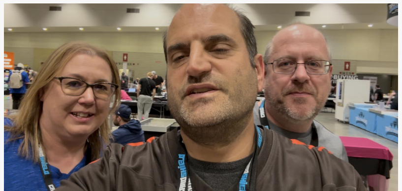
Photo with One of Many Iowa Families Valuing Special Needs Resources About the Delivery of TravelingWiki's Free Resources