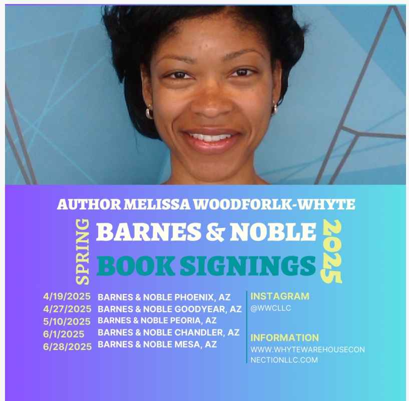
Barnes & Noble Book Signing Events