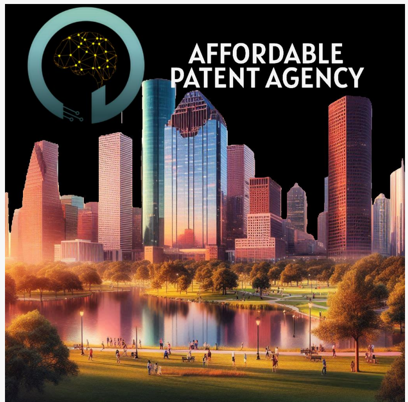
Patent filing services in Houston