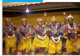
Images From Past HoodTalk Concerts