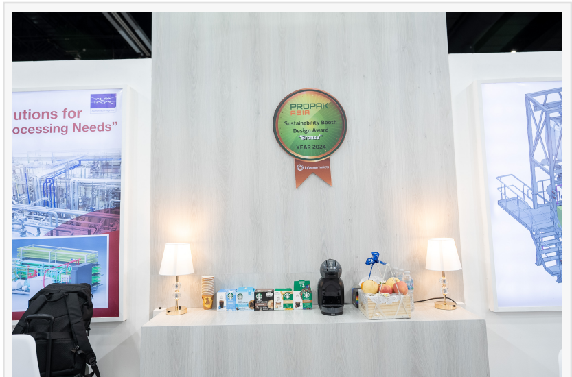
Exhibition stand, Bangkok