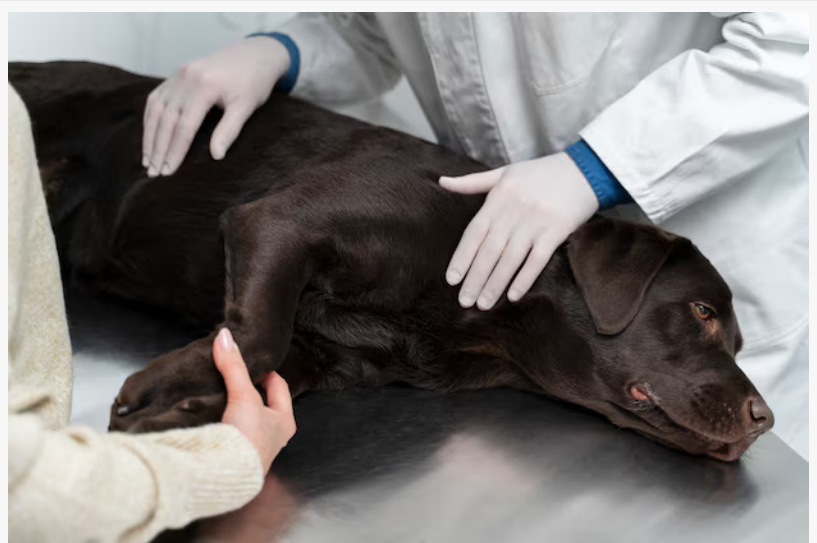
emergency animal hospital Fraser-M ... Animal Hospital

Fraser MacDonald Animal Hospital follows a structured approach to surgical care. Prior to each procedure, veterinarians conduct thorough evaluations to determine the safest course of action.