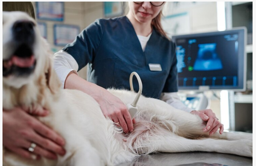
Advanced Dog Abdominal Surgery