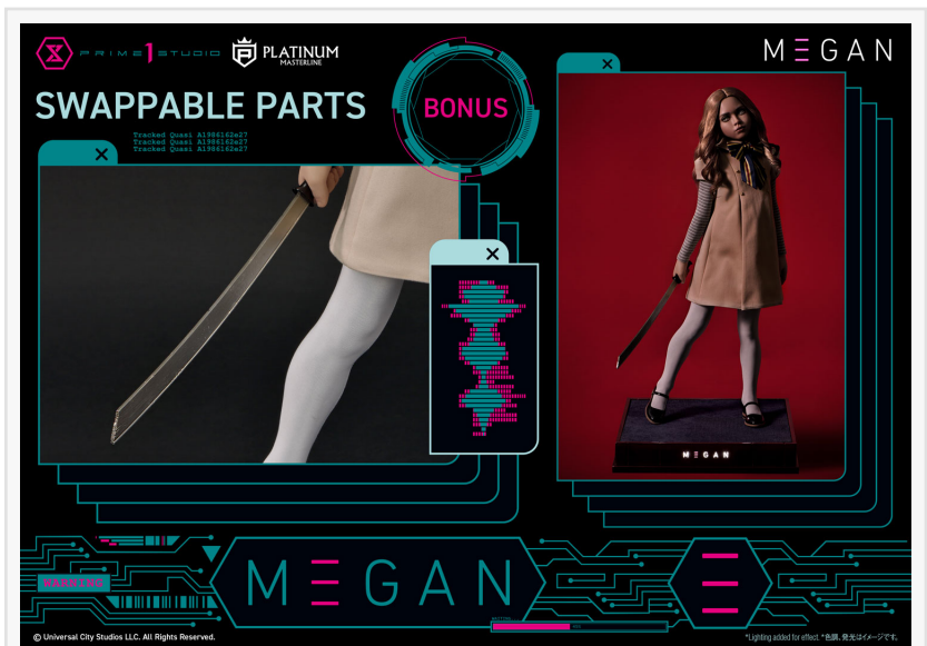
Bonus Part Image01