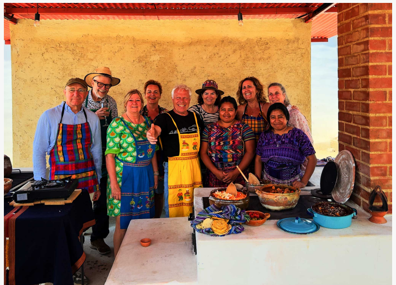
A heartwarming group photo capturing the joy of cultural exchange — travelers and their Maya hosts pause to celebrate a day of cooking, laughter, and shared tradition.

This press release can be viewed online at: https://www.einpresswire.com/article/803072956 EIN Presswire's priority is source transparency. We do not allow opaque clients, and our editors try to be careful about weeding out false and misleading content. As a user, if you see something we have missed, please do bring it to our attention. Your help is welcome. EIN Presswire, Everyone's Internet News Presswire™, tries to define some of the boundaries that are reasonable