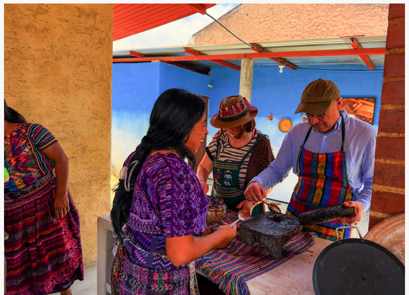
A Mayan cook shares laughter and tradition with travelers during a hands-on culinary workshop, passing down ancient recipes with heart and heritage.