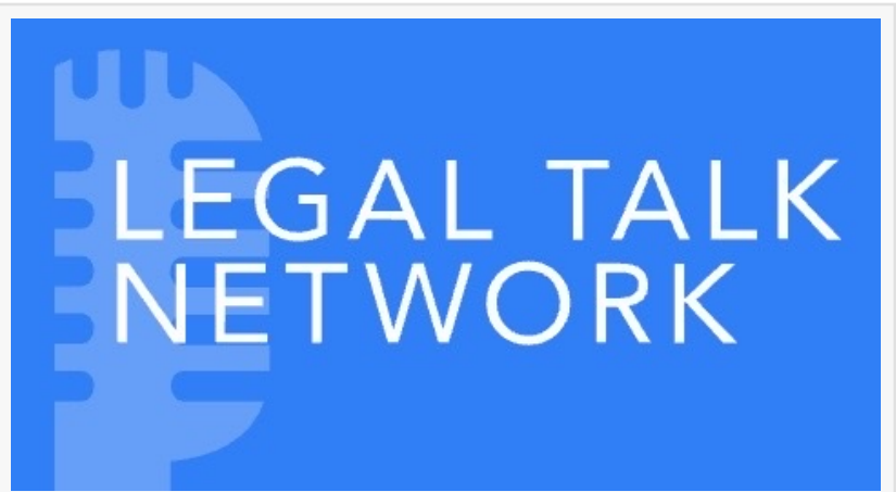
Legal Talk Network Logo