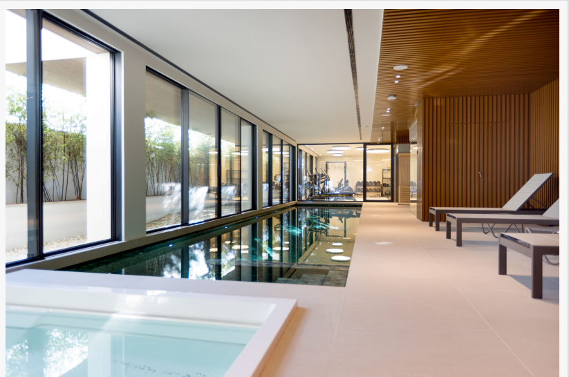
Ikkil Bay has the services of a five-star hotel.

properties can appreciate in value by as much as 35% within five years, driven by the scarcity of high-end developments and the city's consolidation as a prime real estate destination.