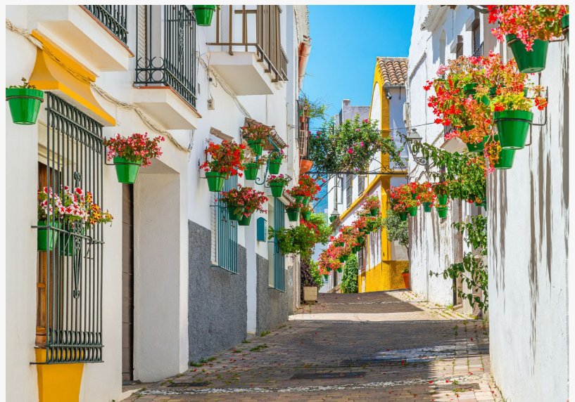
Estepona has managed to maintain its white Andalusian village charm.